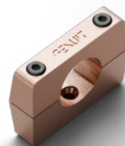
Bracket SF22 Copper 53x13x35 mm