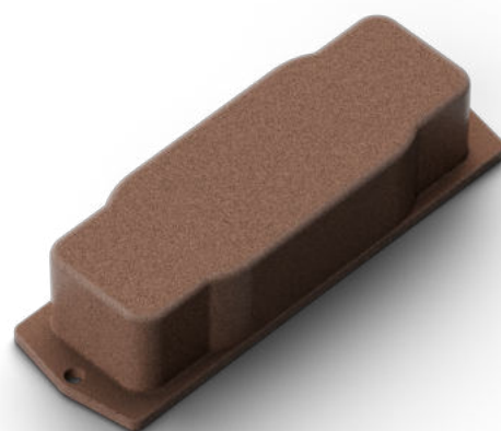
Double Flange FLD Corten 145x46x32 mm