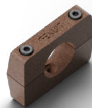
Bracket SF22 Corten 52x12x37 mm